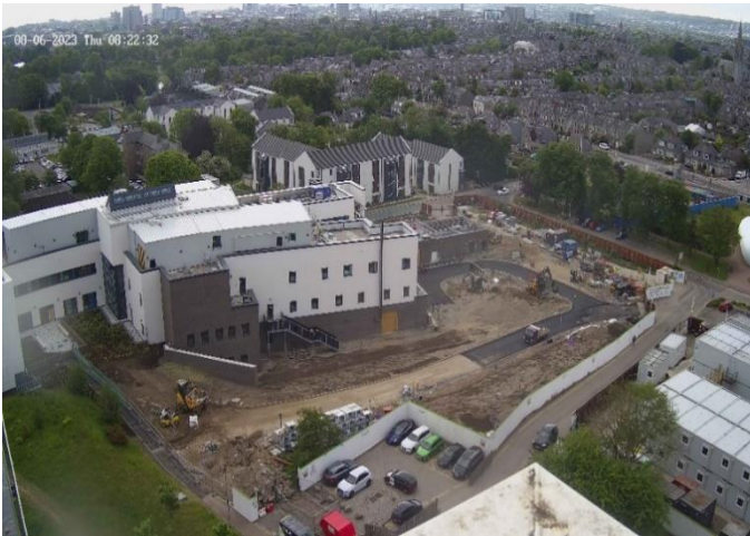
The ANCHOR Centre west elevation – view of the ongoing road formation, landscaping and groundworks.

The fencing, landscaping and planting are progressing well and the access road and pavement formation is underway.