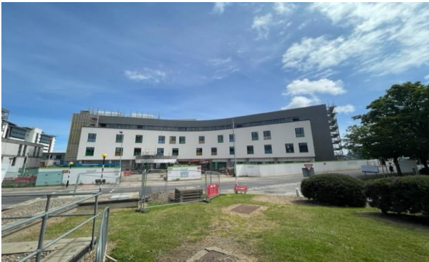
Baird west elevation (main entrance) facing Foresterhill Road – almost complete

The Baird Family Hospital external envelope rendering and cladding is progressing well and has been boosted by the recent spell of good dry weather.