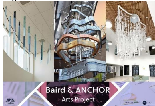
Meet the Artists

We held our last ANCHOR art consultation event on 1 st of July. Look out for dates coming soon for Baird consultation events.