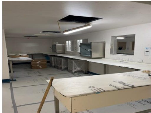
The ANCHOR Centre – Lower Ground Floor Aseptic Pharmacy Suite Outer Support Room

The Aseptic Pharmacy Suite is predominantly complete with the installation of final fixtures and equipment installed leaving only minor snagging prior to commissioning and cleaning.