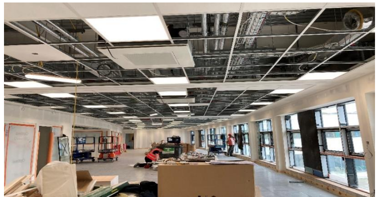
The ANCHOR Centre First Floor - open plan office

The ANCHOR Centre first floor large open plan office for NHS Grampian staff is complete and ready for the ceiling installation and carpet tiles to be laid on top of the raised access steel floor tile system which provides an under floor route for electrical / data cables to floor pods (socket outlets). This ensures minimal disruption to office functions and much more flexibility compared to routing services through ceiling voids and having to install power columns.