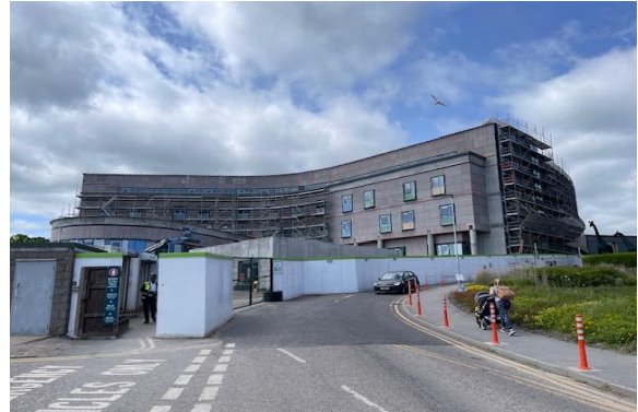
Baird east elevation – scaffolding in process of being erected on east and north elevations in preparation for the insulation / render system

The atrium feature staircase is currently having its fire proofing paint applied and the lift installation has now started.